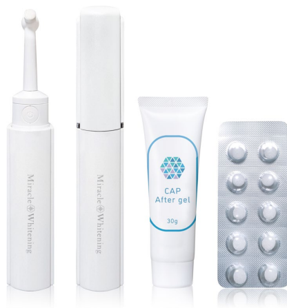
NISHIO CO., LTD Miracle Whitening