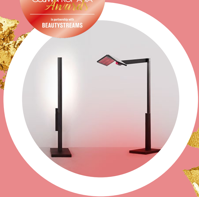
VITAMIN LED Dual Therapy Stand