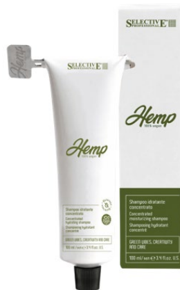
TRICOBITOS SPA HEMP Waterless shampoo