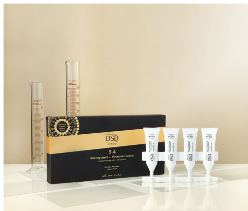
BEAUTE MEDITERRANEA / DSD DE LUXE 9.4 Aminopyrrole Lotion + Melatonin