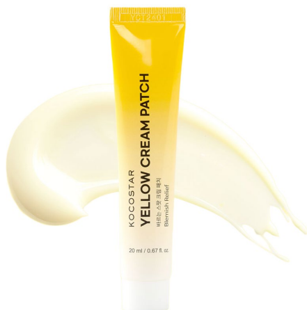
FIRSTMARKET CO., LTD. KOCOSTAR Yellow Cream Patch