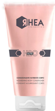
DERMOSFERA SRL Rhea Cosmetics - H2ONutri Nourishing Body Conditioner