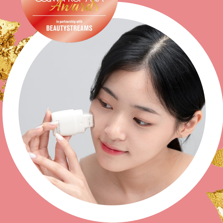
LABNPEOPLE CO., LTD Snow2Plus - Mela Tok (Boostok Eco Mts For Face)