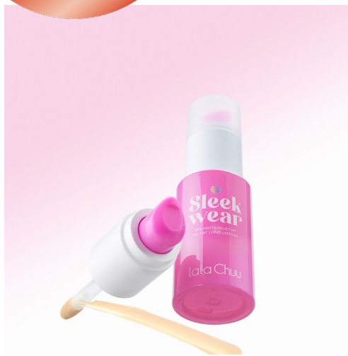
LALACHUU CO.,LTD Sleek Wear Foundation